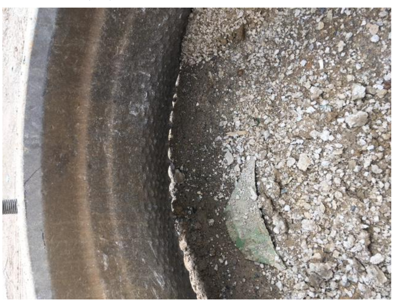
Ionger!! The Wear out Tic insert parts pictures: